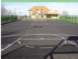
The court and Hall

For more info visit www.waltonvillagehall.org.uk