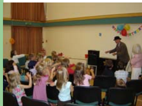
Just one of many varied uses of the hall, a birthday magic show!